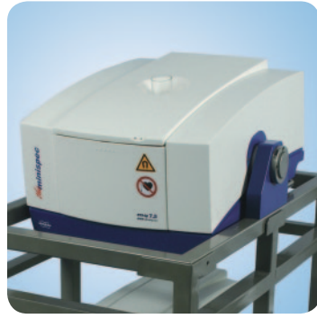
minispec Magnet on Cart for vertical and horizontal Access