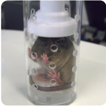
Animal Restrainer with animate Mouse