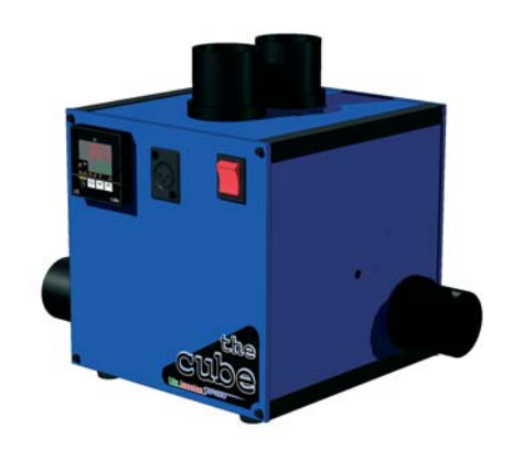
CUBE precision air heater

The BOX is custom-designed for you in order to meet your equipment- and application-specific requirements Our design enables unhindered access to the controls of the microscope and stage area