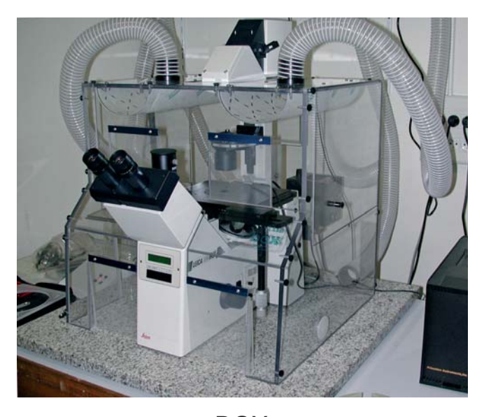
BOX on a Leica DM IRBE